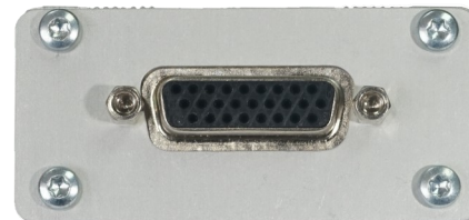
FarSync Flex End views

The bus powered USB adapter will support a sync line at speeds of well over 3 Mbits/s continuously; and async operation up to 115.2 Kbits/s. The highly flexible universal network connector supports RS232, X.21, RS530, RS422, RS449, RS485 and V.35 network interfaces.